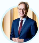
Robbert Dijkgraaf, former Minister of Education, Culture and Science

“Faculty of Impact stimulates valorisation networks and creates knowledge-intensive start-ups, which we desperately need in the Netherlands..”