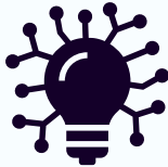
Quality of the idea

They will judge your application based on the following criteria: